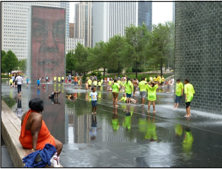
Above: Cooling off in downtown Chicago's water fountains.