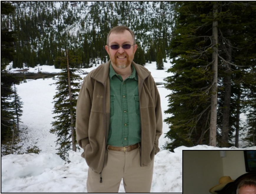
Left: Washington Pass, WA, en-route home from Winthrop, WA.