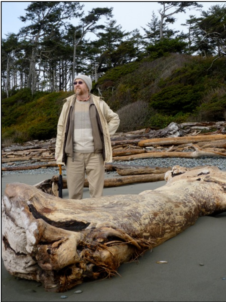
Above: Kalaloch, WA, on Pacific Ocean.