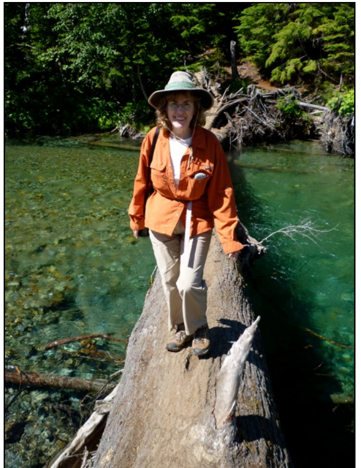
Right: En-route to Monte Cristo, WA, a long-abandoned mining town in the foothills of the Cascade Mountains.